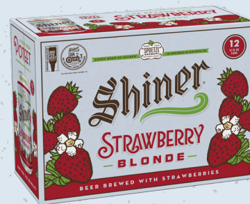
12-PACK CAN WRAP