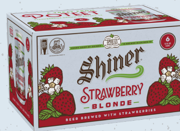
6-PACK CAN WRAP